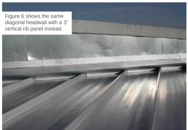
Figure 6 shows the same diagonal headwall with a 3" vertical rib panel instead.