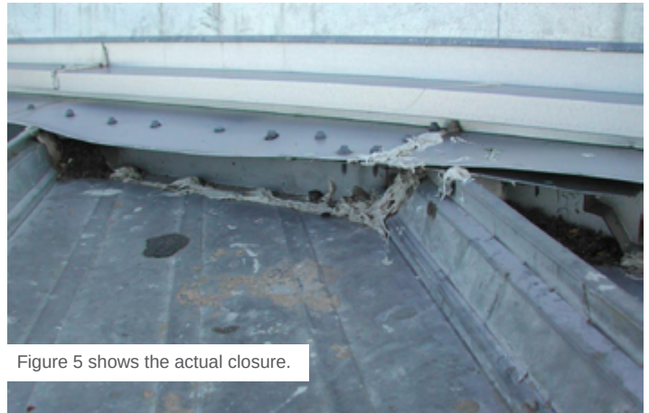
Figure 5 shows the actual closure.