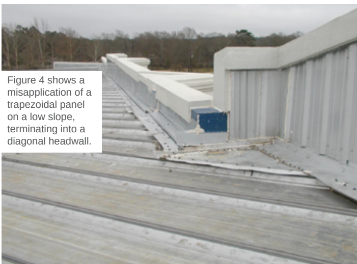
Figure 4 shows a misapplication of a trapezoidal panel on a low slope, terminating into a diagonal headwall.